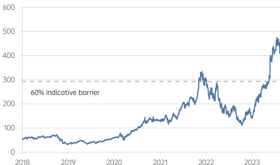
As of: August 29, 2023; Source: Bloomberg (NVDA.UQ); ISIN: US67066G1040 Please note that past performance is no reliable indicator for future results.

NVIDIA is one of the largest developers of graphics processors and chipsets for computers, servers and game consoles.