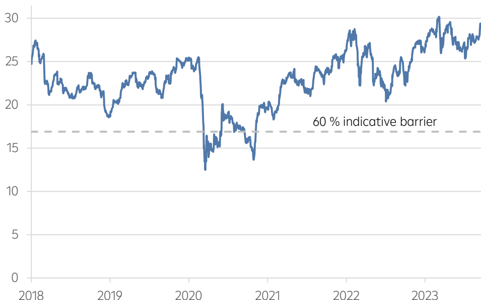
As of: October 2, 2023; ISIN: FR0000120628 Please note that past performance is no reliable indicator for future results.

AXA SA is a French-based insurance company operating in the field of financial protection. AXA offers a wide range of products in various business areas: Life & Savings, Property & Casualty, Health, Asset Management and Banking.