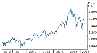
Source: Reuters (.SDGP) as of April 11, 2016. Please note that past performances do not allow any inferences to be made about future performances of this underlying.